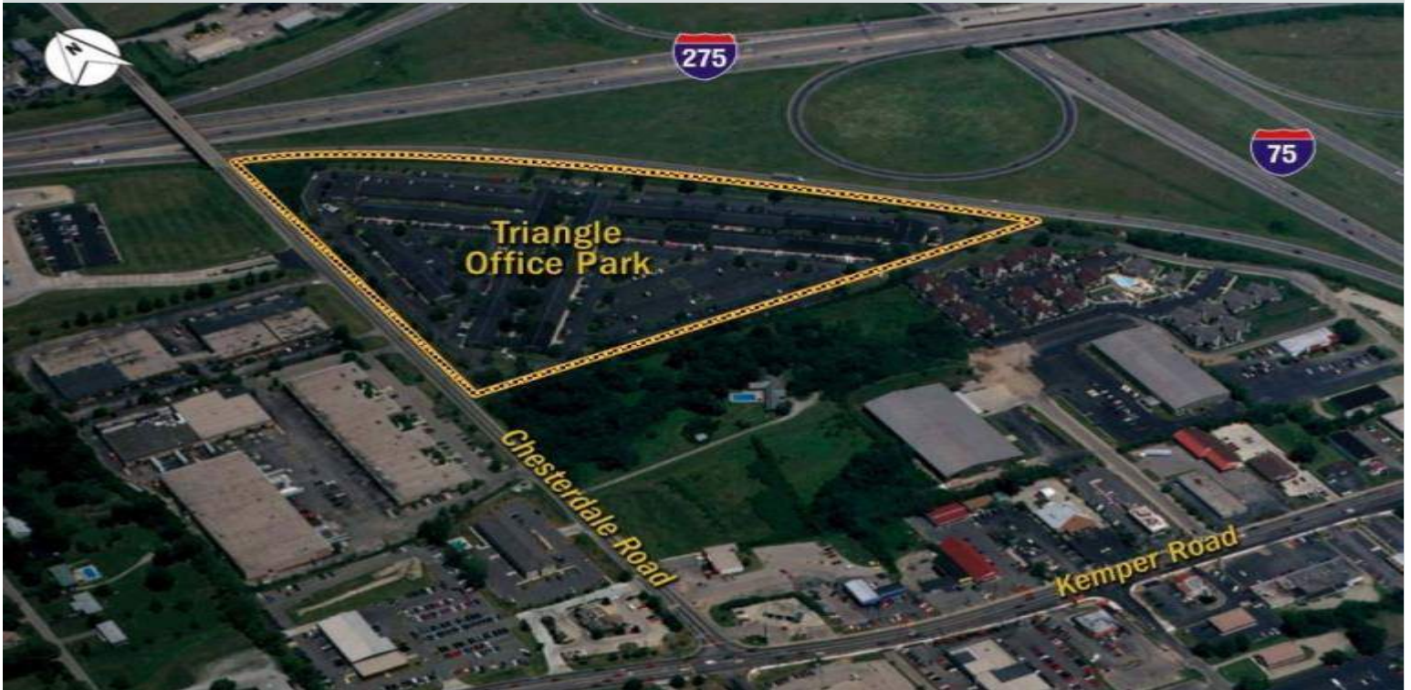
Cincinnati's most central suburban office location

Todd Pease +1 513 297 2506 Todd.pease@am.jll.com