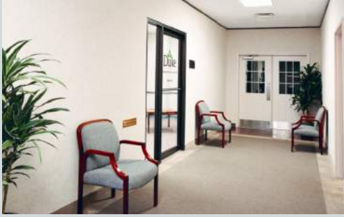
High-quality tenant finish