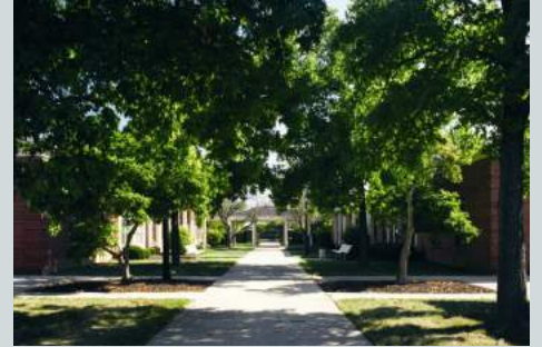
Park-like setting; Campus environment